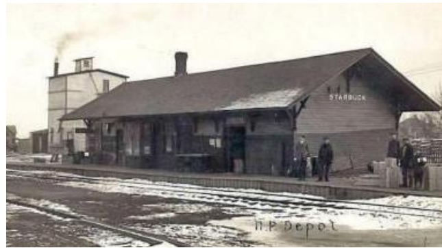
The Railroad Depot