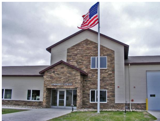
Starbuck Community Center

One only has to take a tour of the city of Starbuck to see some of the other projects her foundation has funded.